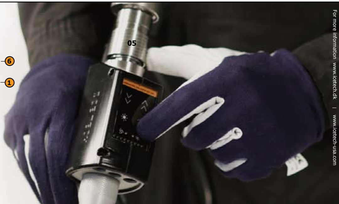
01 : 06